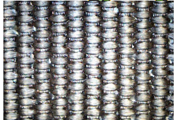
Microscopic view of COBRA™ filament threads and plain weave.

Introductory Promo Price in effect until October 31, 2017